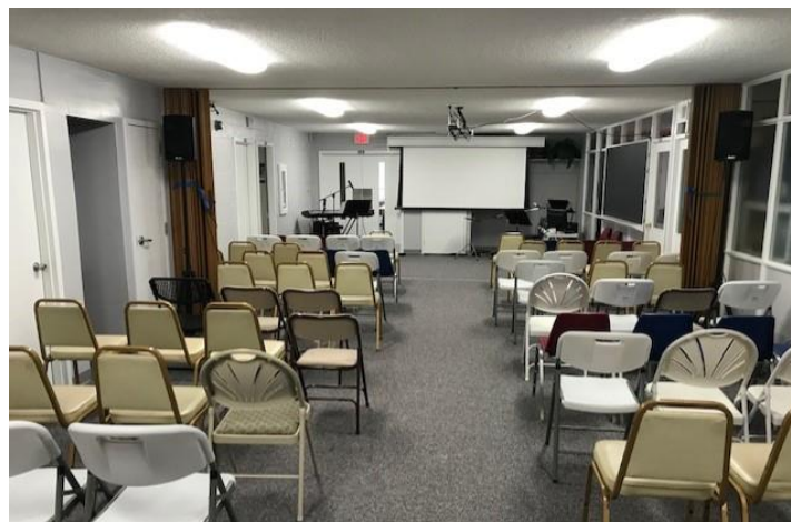
Our 2/3 rd Braddock Baptist Church Temporary Sanctuary

For Sunday Service, we are now partially reopening on the third floor for worship. The church renovation is in full swing and we are waiting expectantly to see our new sanctuary, fellowship hall, and lobby. Please be flexible in this time of transition and let us know if you have any questions. For those unable to do three flights of stairs, or unable to come due to being at high risk for Covid-19, you can also find our livestream on YouTube @ "Braddock Baptist Church." Sunday School starts at 9:45am, and Service starts at 11:00am! Please see updated pictures of renovation below!