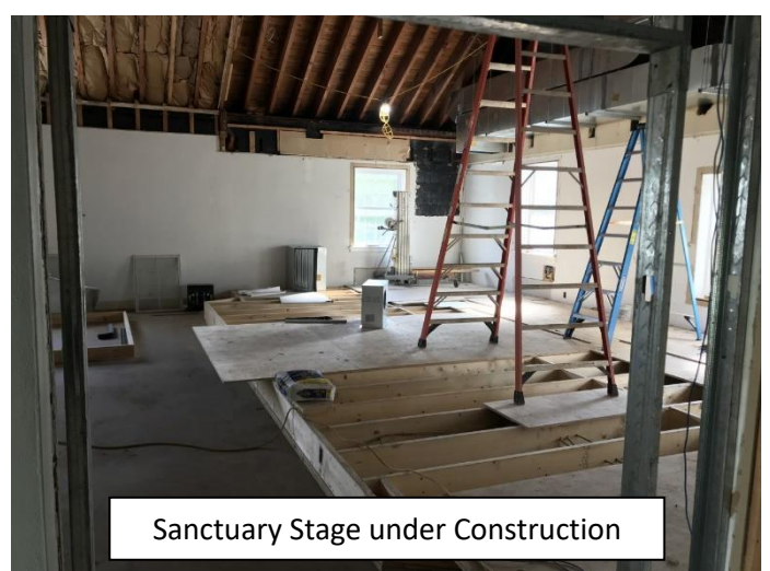
Sanctuary Stage under Construction